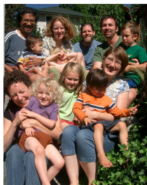
living in community