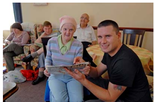
Living in a Care Home